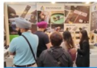
Global Sources Mobile Electronics