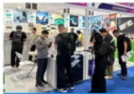
Guangzhou International Electronics