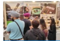
Global Sources Mobile Electronics