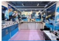
Global Sources Mobile Electronics