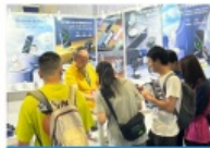
Shenzhen Gift Fair