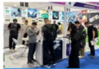
Guangzhou International Electronics